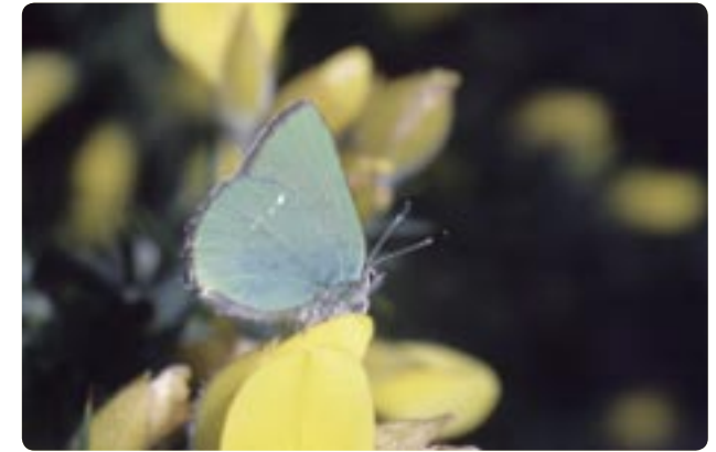
Green Hairstreak (Ian Rippey)